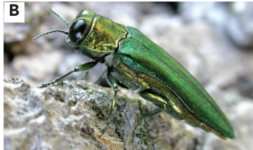
Michigan State University